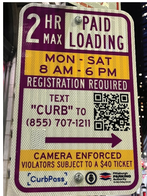
A DOWNTOWN SMART LOADING ZONE SIGN