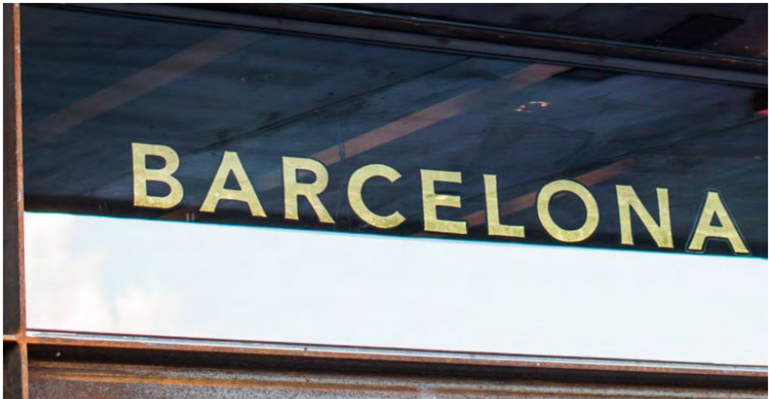
EXAMPLE OF GOLD 'BARCELONA' DECAL