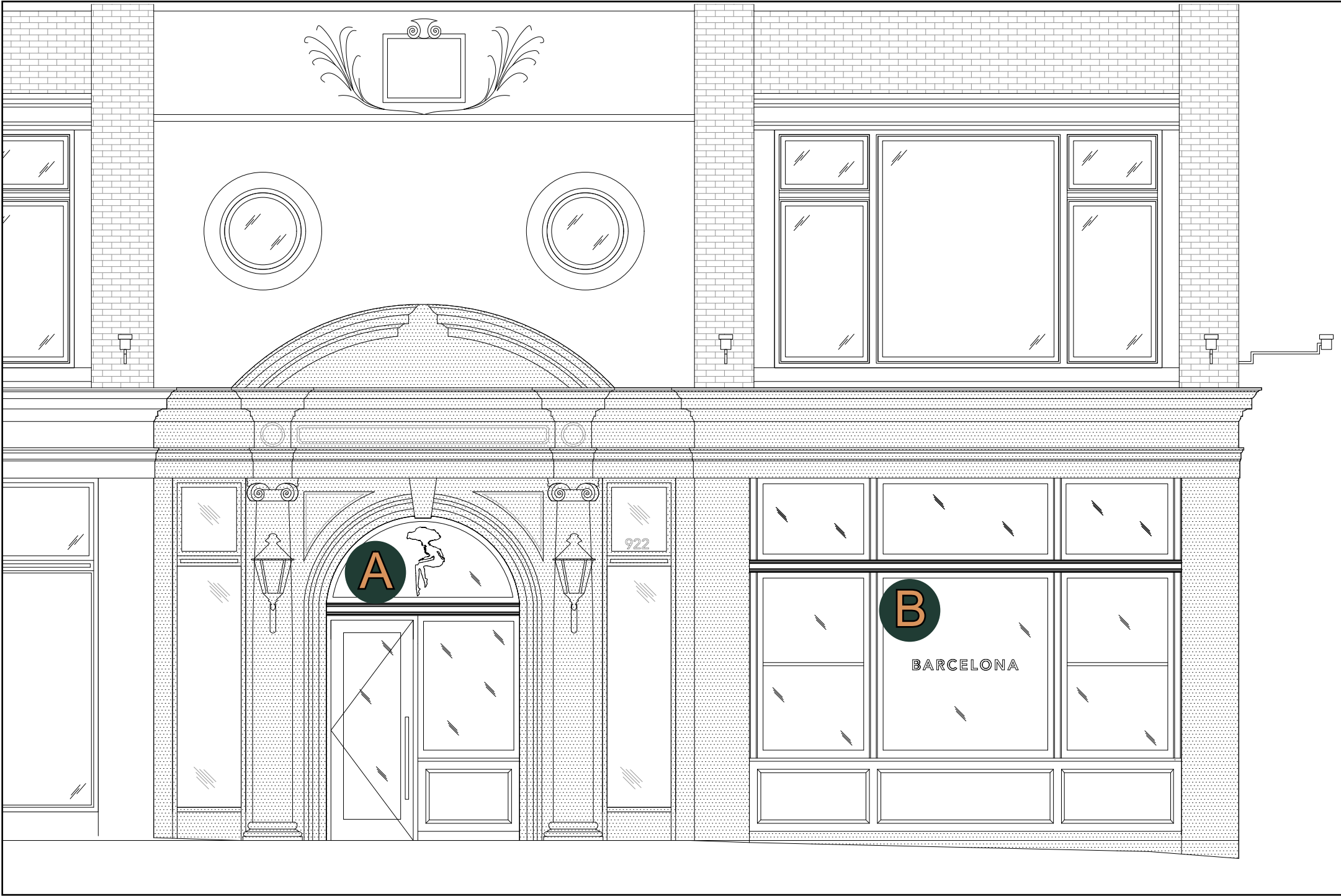
1 NORTH-WEST EXTERIOR ELEVATION SCALE: 1/4" = 1'-0"