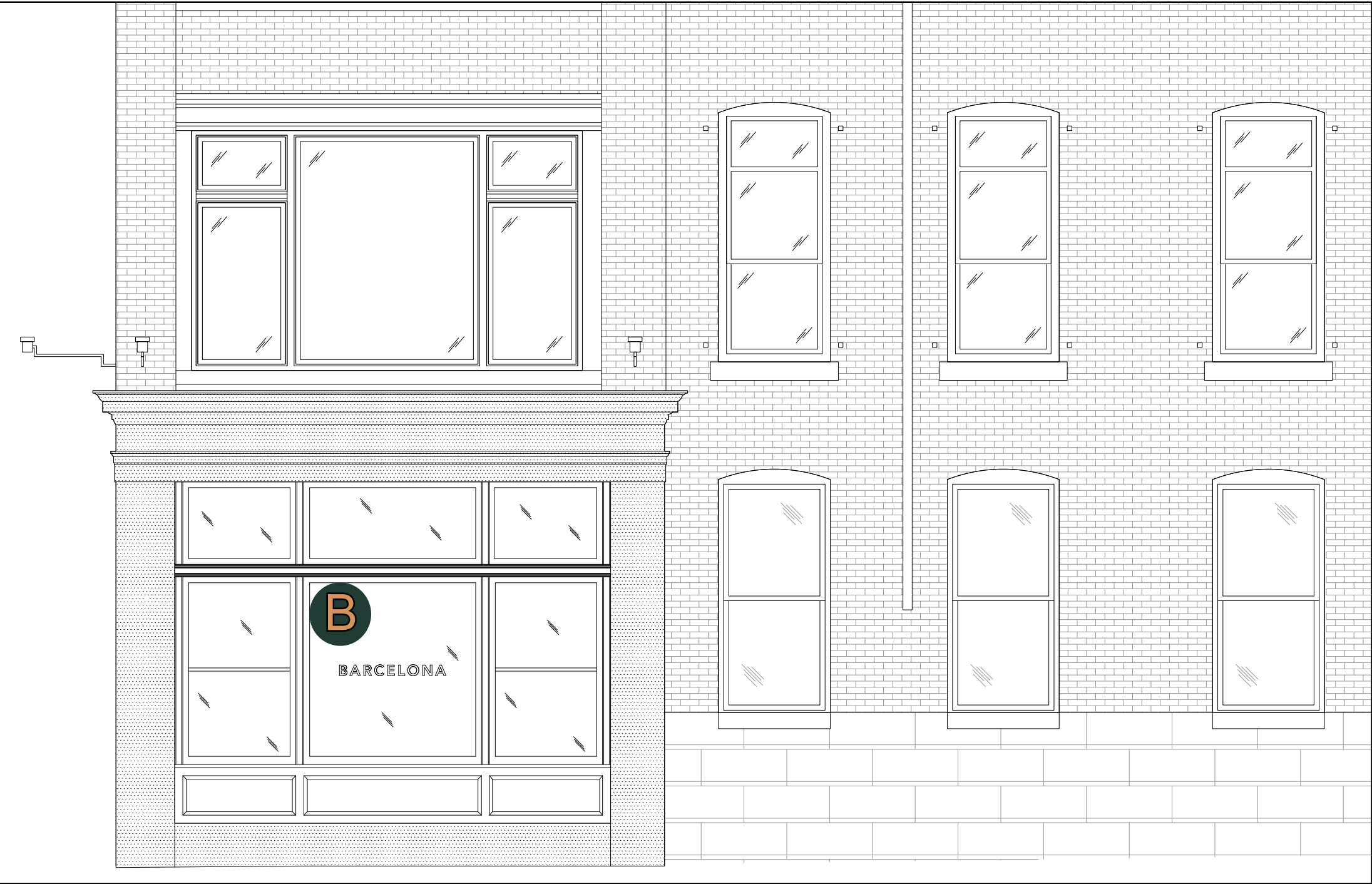
1 SOUTH-EAST EXTERIOR ELEVATION SCALE: 1/4" = 1'-0"