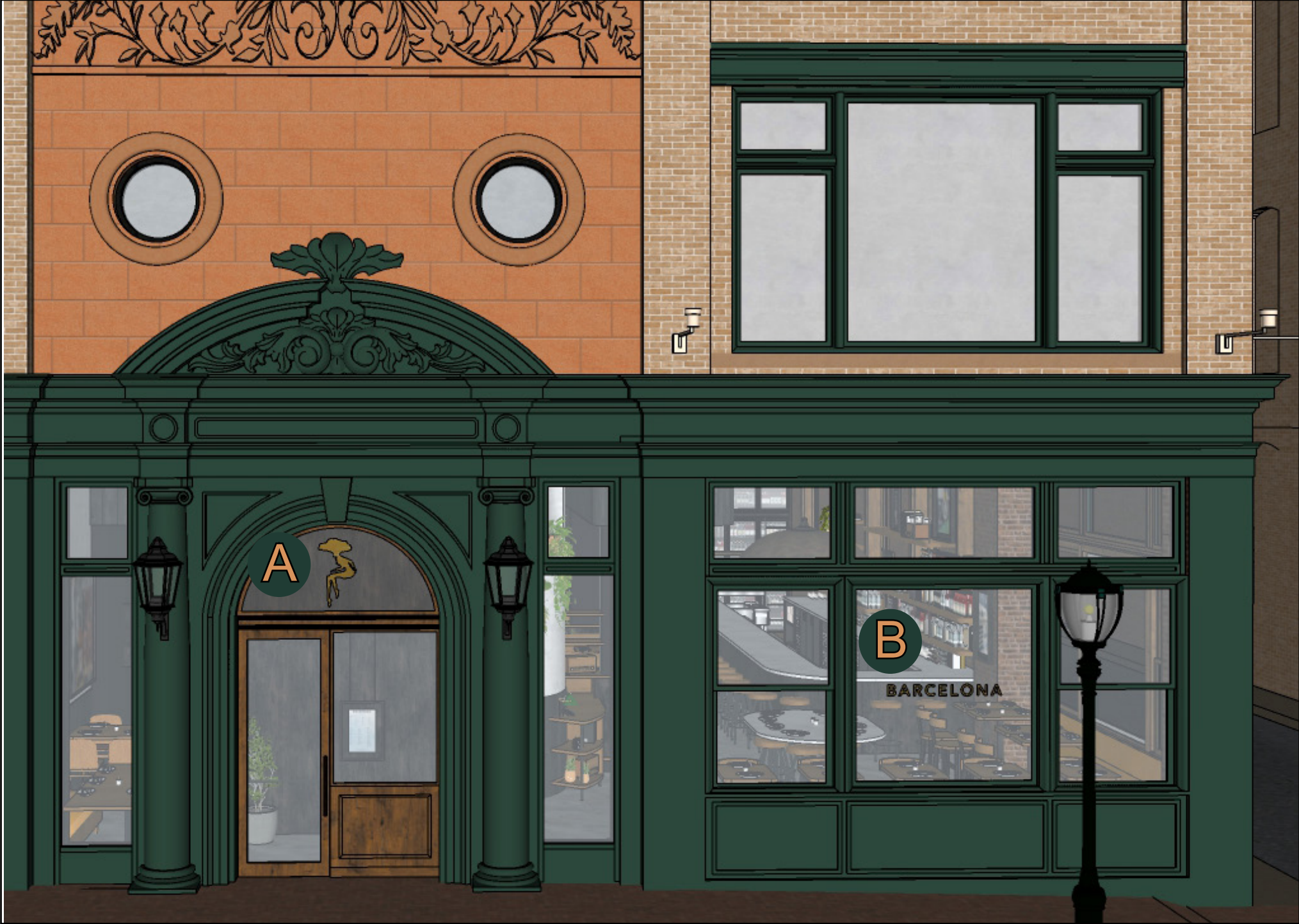
2 NORTH-WEST EXTERIOR ELEVATION NOT TO SCALE