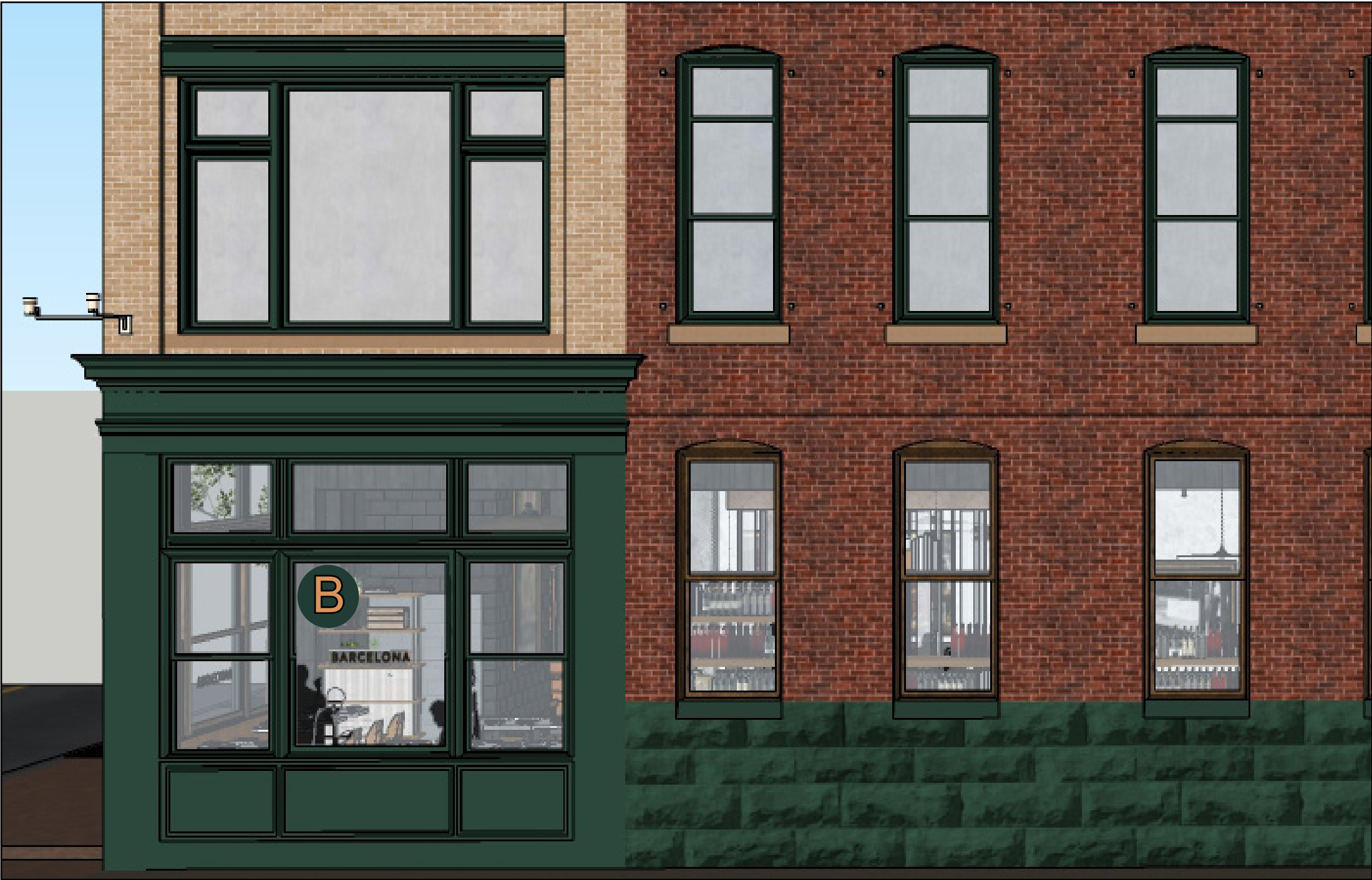
2 SOUTH-EAST EXTERIOR ELEVATION NOT TO SCALE