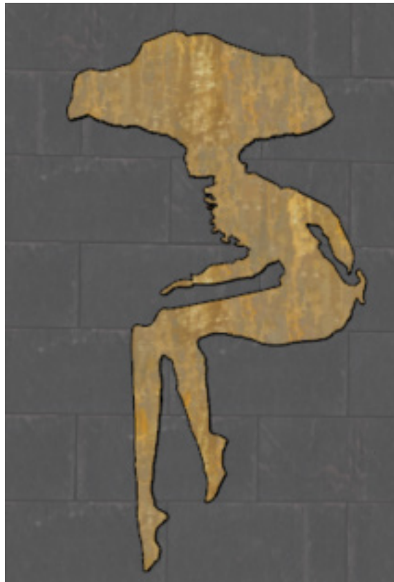
EXAMPLE OF GOLD 'BARCELONA LADY' DECAL