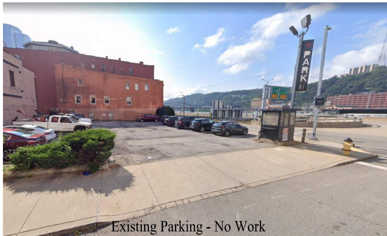
Existing Parking - No Work