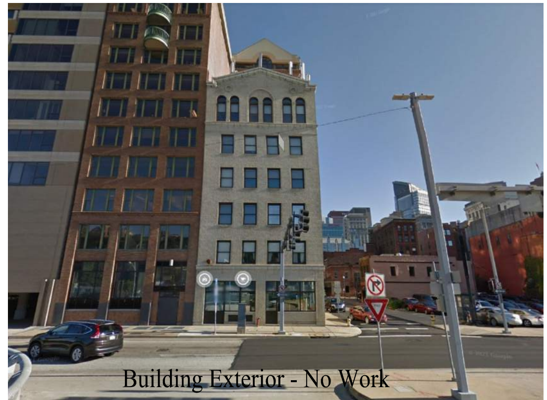
Building Exterior - No Work