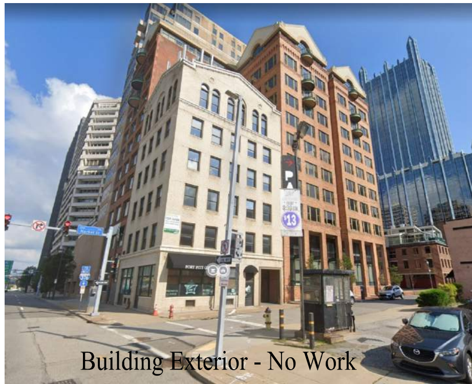
Building Exterior - No Work