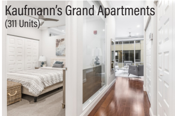
Kaufmann's Grand Apartments (311 Units)