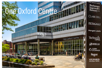
One Oxford Centre