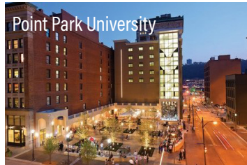
Point Park University