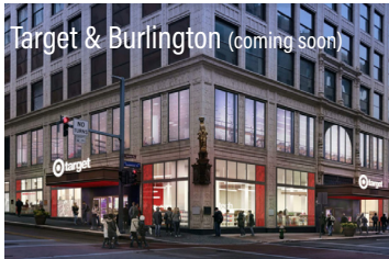
Target & Burlington (coming soon)