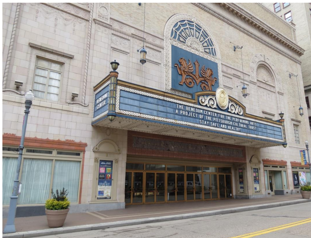
Seventh Street Marquee