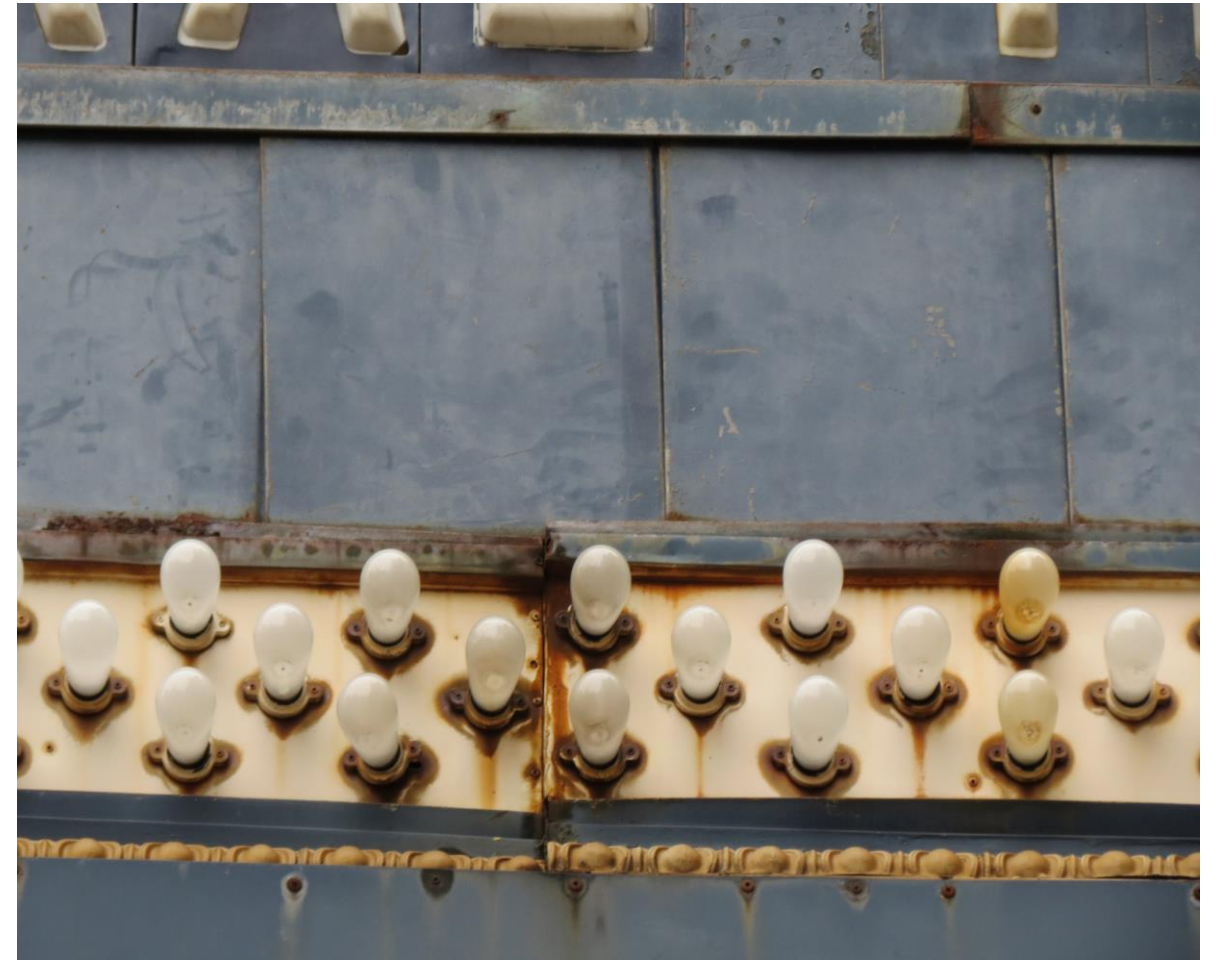
Additional signs of rust and deterioration