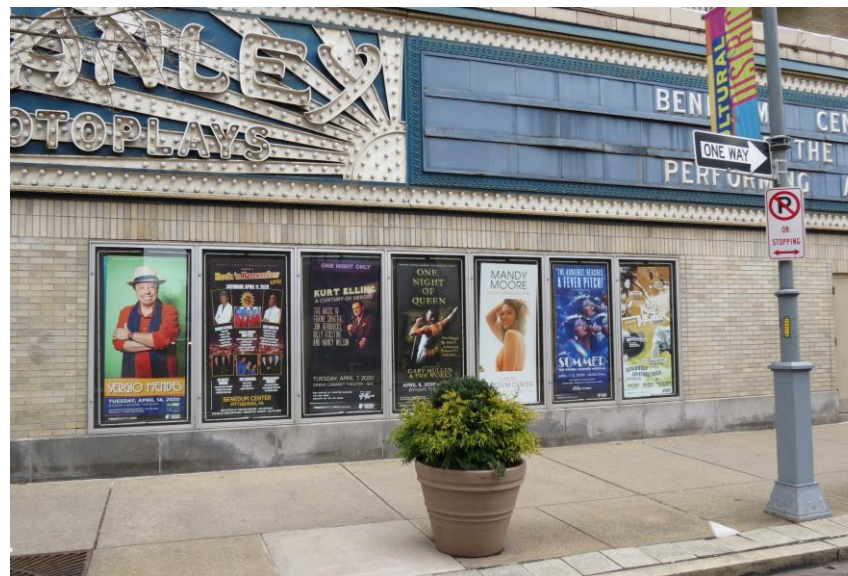
Current Benedum Center Poster Cases