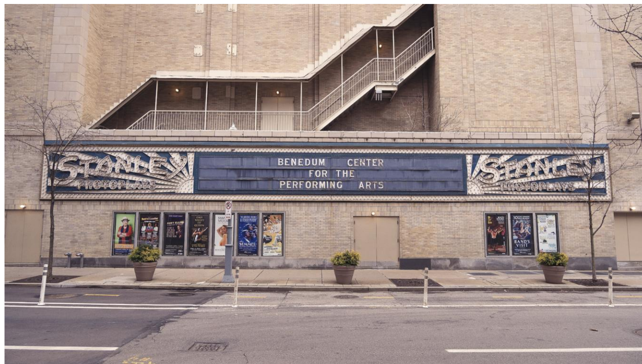
Penn Avenue Marquee