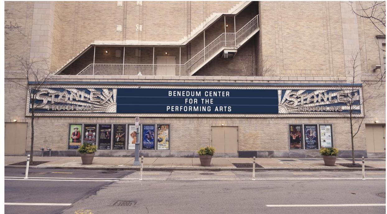
New Marquee Rendering