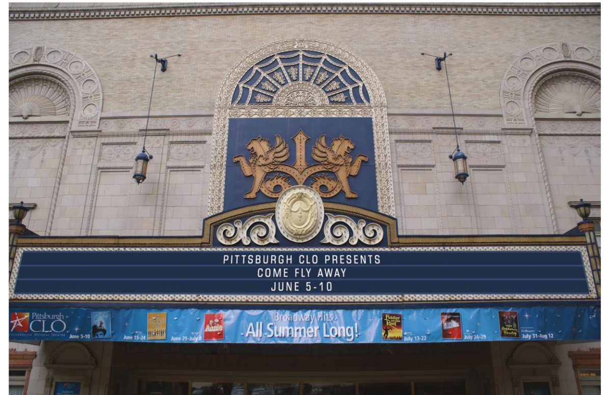
New Marquee Rendering