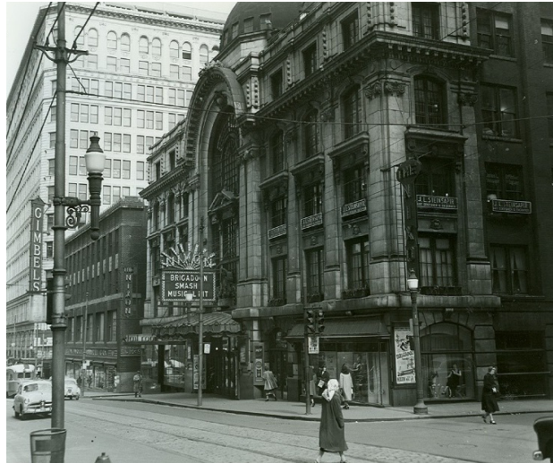
Corner of Smithfield and 6th Avenue, before Alcoa, and with Alcoa under construction