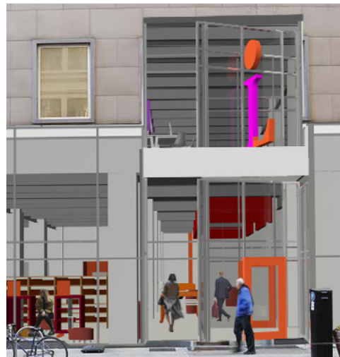
Street view before