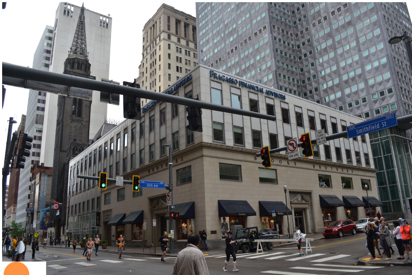
Corner of Smithfield and 6th Avenue, on Marathon Day 2019