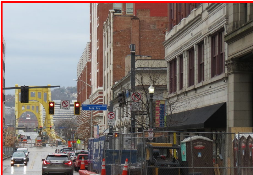
Penn Ave and Tito Way