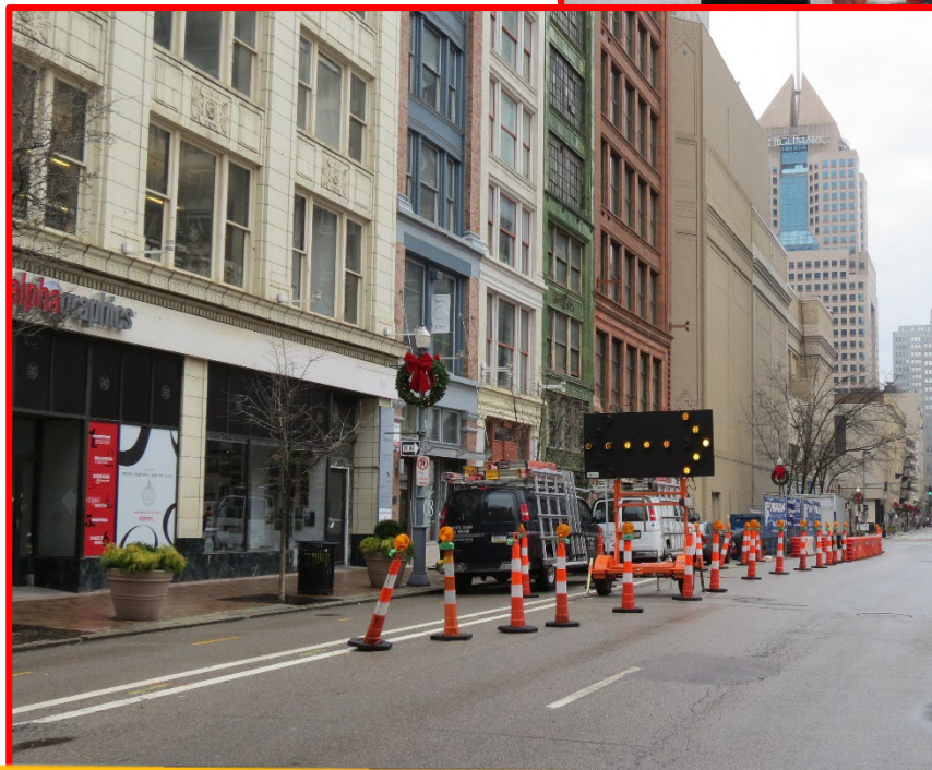
Penn Ave between 9 th and Tito Way