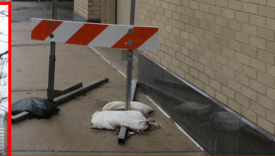
Corner of 9 th and Penn Ave